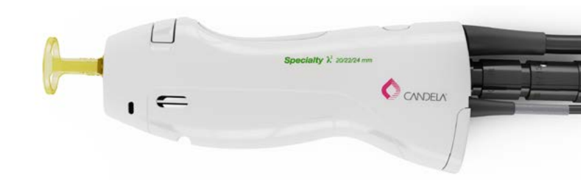
Dynamic Cooling Device (DCD) Large Spot Delivery System Handpiece