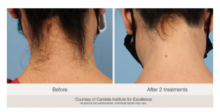
Laser Hair Removal